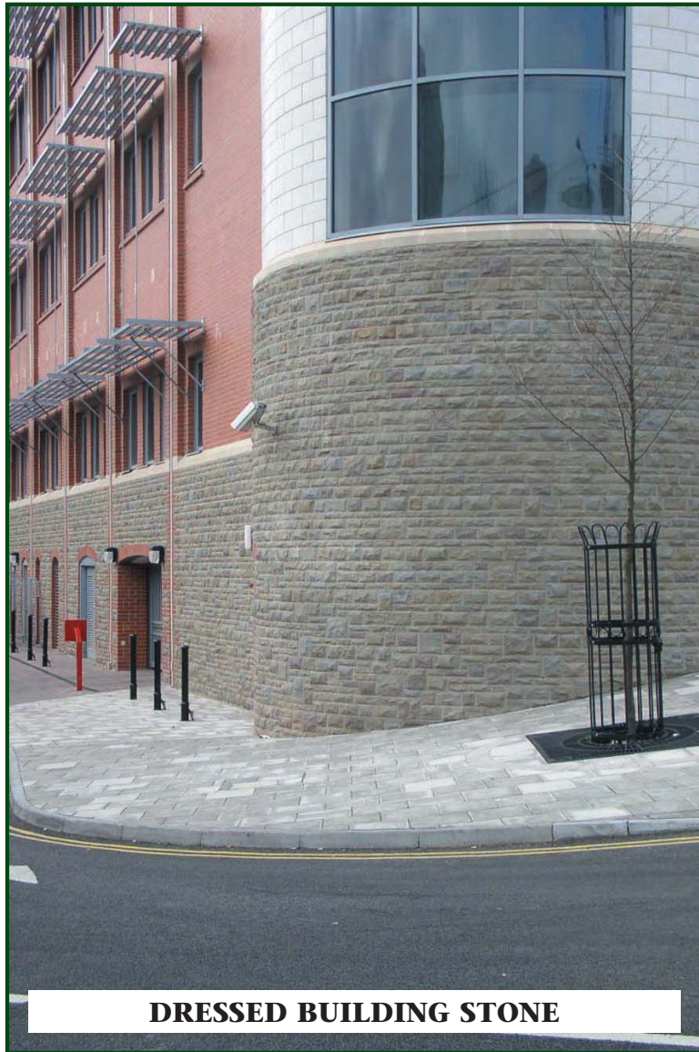
DRESSED BUILDING STONE

TEL NO: 01594 562304 FAX NO: 01594 564184 Email: mail@forestofdeanstone.co.uk