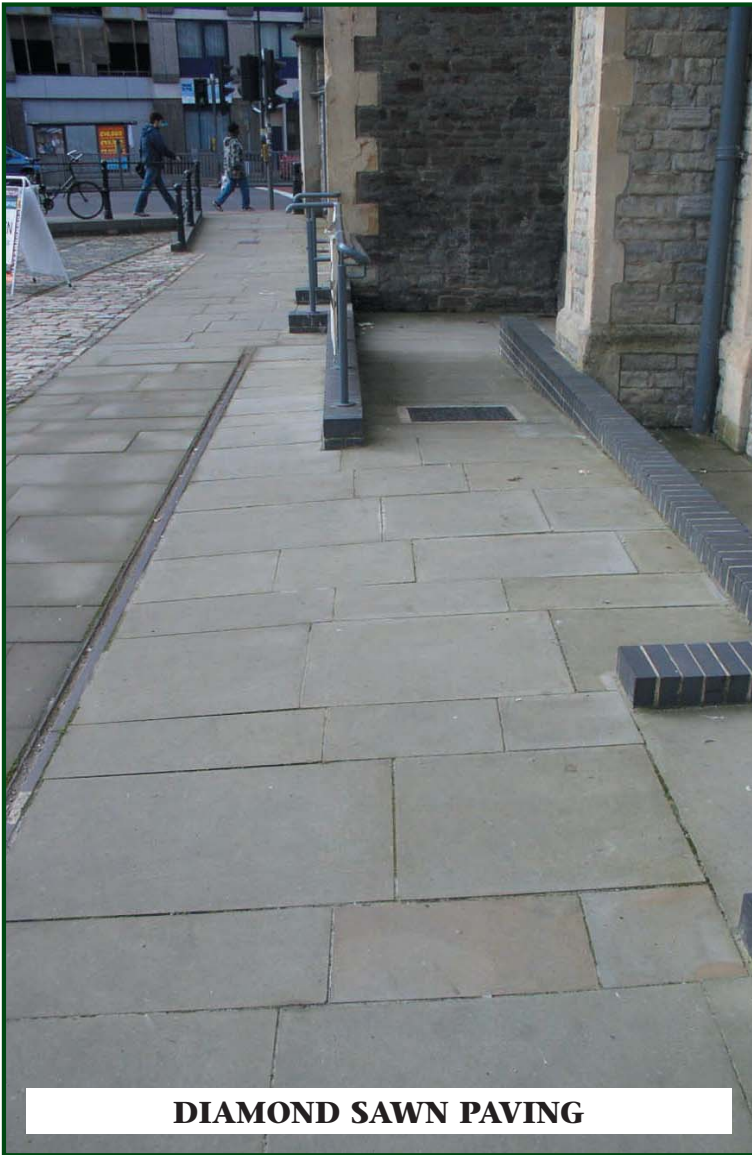
DIAMOND SAWN PAVING

TEL NO: 01594 562304 FAX NO: 01594 564184 Email: mail@forestofdeanstone.co.uk